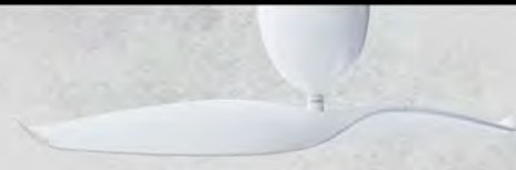
2-Blade Model: AE2