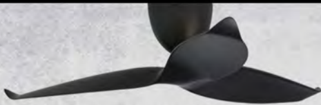
3-Blade Model: AE3